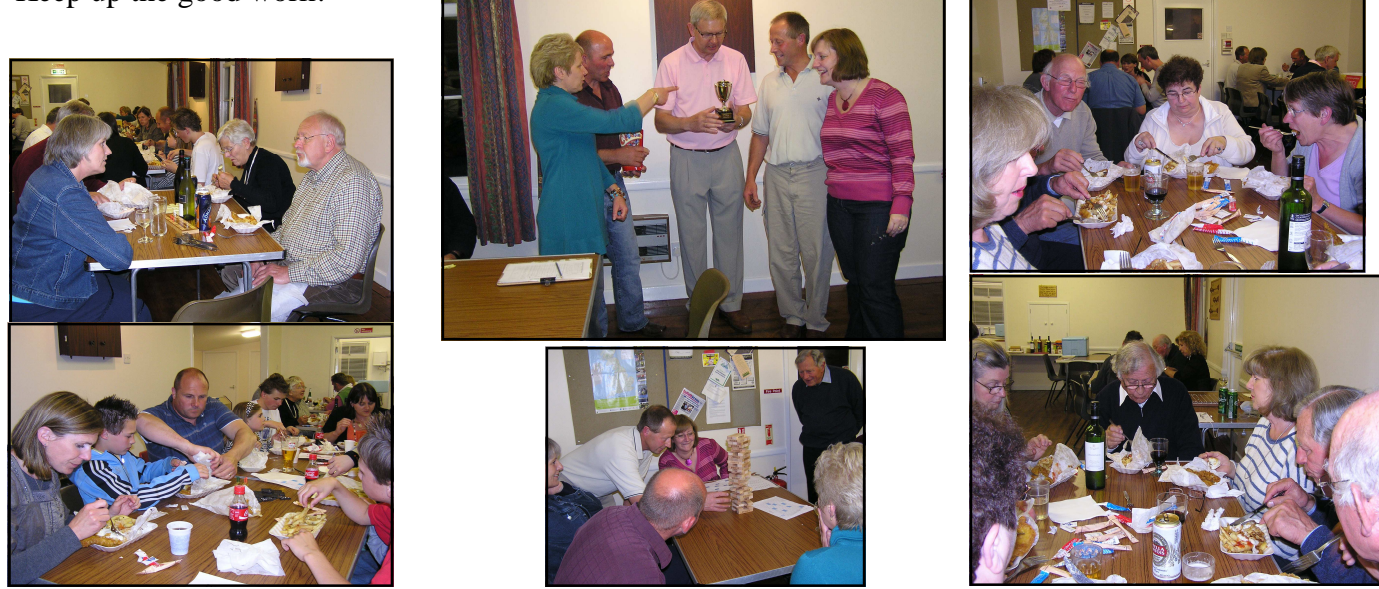
Pettistree Parish Council June 2008 ©